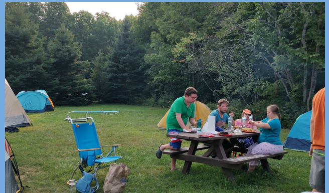
Residents dubbed their tents "Apart-tents."

After tents were set up and supper prepared, everyone sat around the campfire and made s'mores. In the morning a yummy breakfast was shared amid stories of the owl that was heard in the night. The trip was a huge success, and everybody is ready to try two nights next year. Lamoine State Park's group camping site is a treasure!!